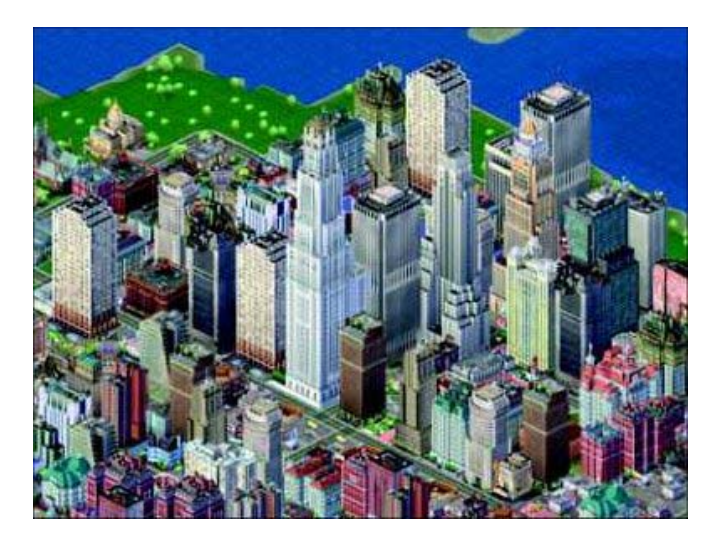
Figure 2. Is SimCity a game?

You play with a toy but you do not play with a game. You play the game. With a toy there are no predefined goals although during play you tend to set such goals yourself. A number of computer games actually are close to being toys. For example, in SimCity or The Sims there are no clearly defined goals. You can build your own city or family and most likely set your own goals (like creating the biggest city) but there is not really a notion of winning the game. One could add this (e.g. you could add that the game is won when your city has reached a particular population) but this can be frustrating because it is not a natural ending. This being said, there is nothing wrong with creating a nice interactive computer toy.