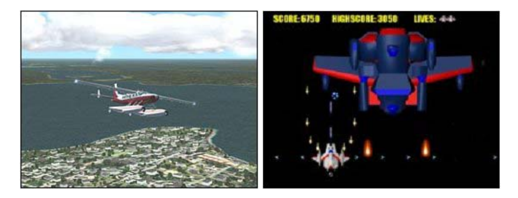
Figure 4. A flight simulator should be realistic, while a scrolling shooter can be more abstract.

A realistic three-dimensional world can also hamper game play. For example, many strategy games use a form of overhead view of the game world in which you view it under a 45 degree angle (a isometric view). This makes it easy to track your units and to quickly see what is happening. You can easily scroll over the world to steer your units in doing the right things. Trying to do the same in a full three-dimensional world is a lot harder. You quickly loose your orientation, and have difficulty in keeping track of what is happening in the world. Moving around is more difficult. Again you must adapt the representation of the game world to the game play that is required.