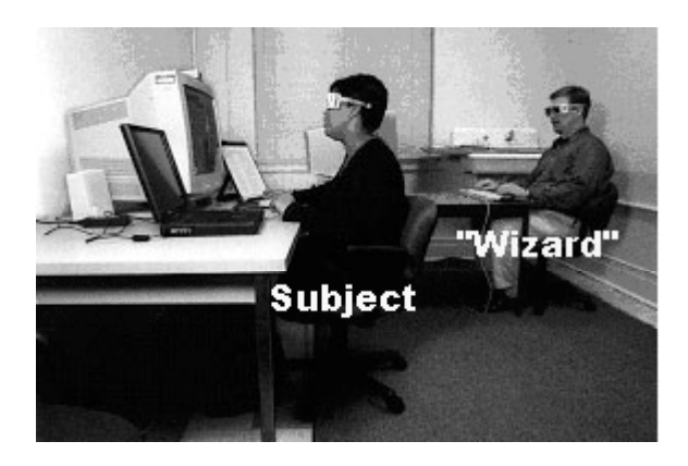
Figure 1 Photograph of equipment setup.

The ordnance disposal task required participants to navigate the rover in a very large virtual setting with undulating terrain, trees, ponds, fences, and so on, and to use the demining tools to locate, uncover, identify, and neutralize landmines. Participants used verbal commands and a standard keyboard and mouse controller to drive and manipulate the robotic arm, in general. A "Wizard of Oz" setup (see Figure 1) was used, and an experimenter (the "Wizard") executed verbal commands via a second keyboard to assist the participants in responding to system auditory warnings, controlling joint rotations of the manipulator, selecting tools, and responding to secondary system-monitoring tasks