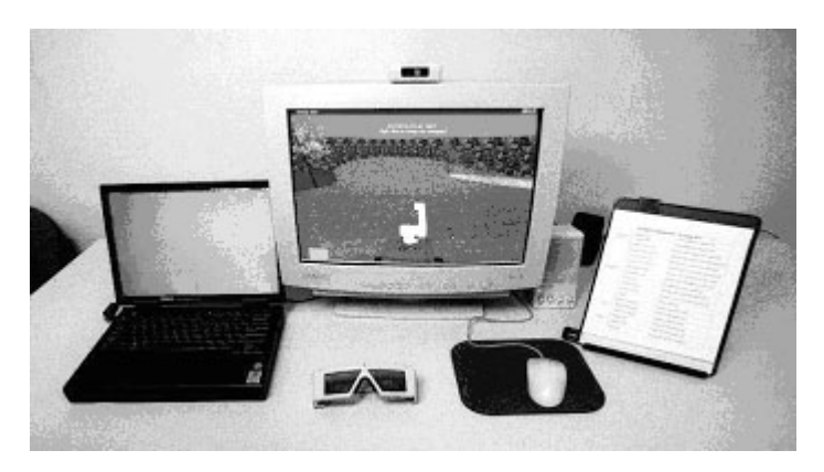
Figure 2 Photograph of the experimental workstation and displays.

as familiarity with personal computers. Participants were randomly assigned to the LOD groups.