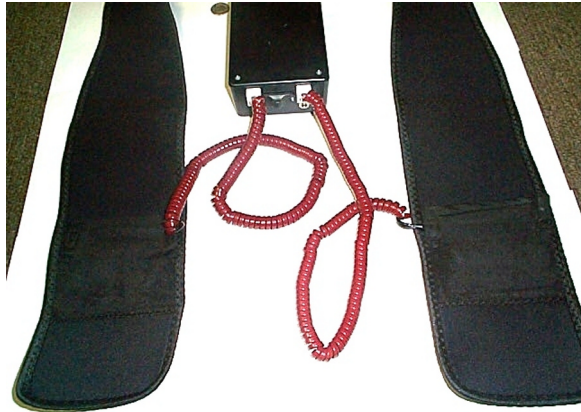
Figure 2: TactaArmBands attached to the TactaBox using coiled phone cord. Tactors are mounted on the underside of the armbands, covered by a thin piece of cloth.

mitigate this problem. The flat bottom helps to insure that pressure from the elastic armband is applied evenly across the tactor. The circular shape produces a region of influence of the vibration whose edges are equidistant from the center of vibration. Finally, the near-point cone helps better direct the vibration to a point on the person.