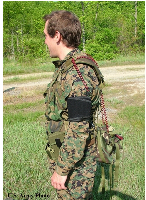
Figure 4: TactaArmBand system in a test deployment.

Three participants donned the TactaArmBand system and ran through different sections of an obstacle course. The TactaBox was worn inside a fanny pack, and the cables were run up the webbing of a harness to the armbands (Figure 4).